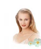
Fair skin with amazing shining

Aging is the progressive accumulation of change with time associated with or responsible for the ever-increasing susceptibility to disease and death which accompanies advancing age. These time-related changes are attributed to the aging process. This process may be common to all living things, for the phenomenon of aging and death is universal. Reducing free radical can increase the life span of mice, fruit flies, nematodes, rotifers and human being.