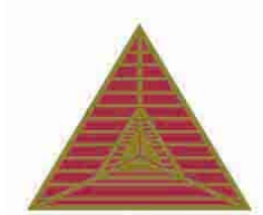
Aloe & Noni Juice Mix EI